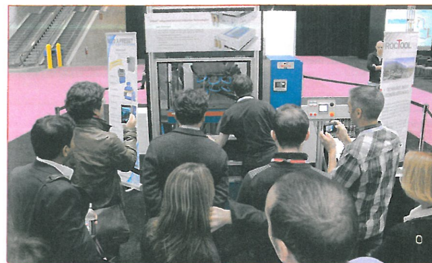
Live Demo Zone presenting new reinforced thermoplastic technologies and Heat & Cool Process.

gathered the whole composites value chain and professionals from as many sectors as the composite End-users could involve. It also allowed the local stakeholders to offer their products to the world thanks to its international attendance from Europe, Asia, Middle East and of course, the Americas. The Business Meetings program organized pre arranged meetings for companies, allowing them to discuss with the right person from their target companies.